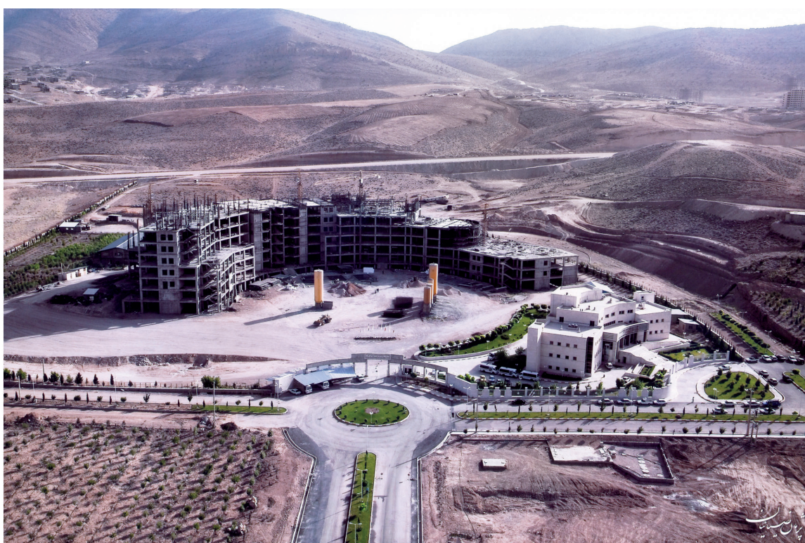
Avicenna Organ Transplant Institute under construction. Shiraz, southern Iran