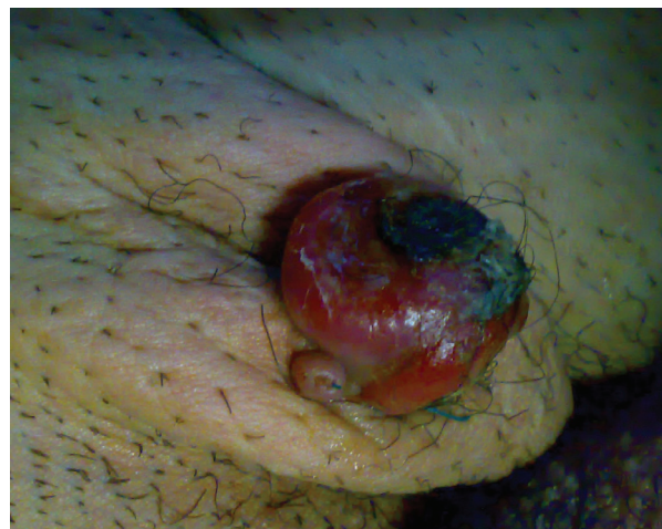
Figure 1: Appearance of the lesion: reddish, ulcerated, approximately 3 cm in diameter

azathioprine) was begun after the surgery. In May 2012, the patient developed painless left inguinal mass that expanded in size over the previous four months. Examination of the skin revealed a reddish and ulcerative mass, about 3 cm in diameter on the left inguinal area (Fig. 1). There is no inguinal, axillary, or neck lymphadenopathy. The patient underwent wide-local excision of the mass. The specimen excised